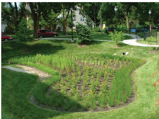
PLANTINGS AND PATH