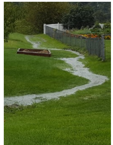
OBSTRUCTION IN SWALE